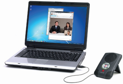
Plug and play simplicity for Microsoft® Lync®